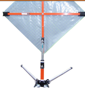
C/ Battens displayed on C-202 Half-Mast [shown above]