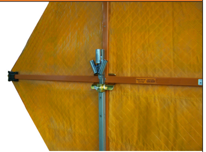
R/ Battens displayed on X-841 Full-Mast [shown above]